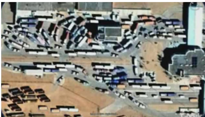
Google maps image of congestion in Zamyn Uud Summer 2008

Mongolia ranks at 156 out of 181 countries with respect to the ability to facilitate trade across borders. This is quite significant for a country that imports 70 percent of its essential foods, 80 percent of industry goods and 100 percent of equipment, machinery and fuel and petroleum products. 60 to 70 percent of overall imported goods enter the country through Mongolia's southern border with China in Zamyn Uud.